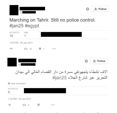
Figure 1: Sample of Tweets Reporting Movement Towards Tahrir

Translation: Thousands of activists heading in a march from the High Court to Tahrir Square via Galaa Street